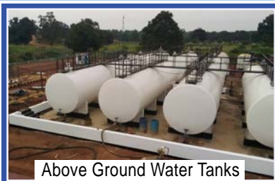
Above Ground Water Tanks