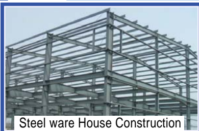
Steel ware House Construction