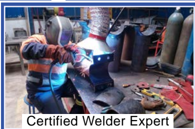
Certified Welder Expert