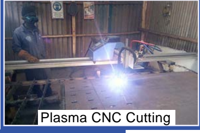
Plasma CNC Cutting