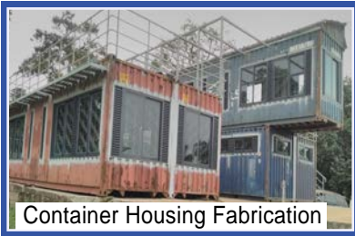
Container Housing Fabrication