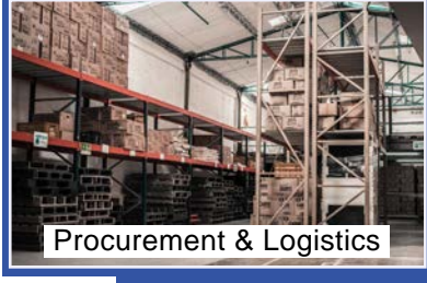
Procurement & Logistics